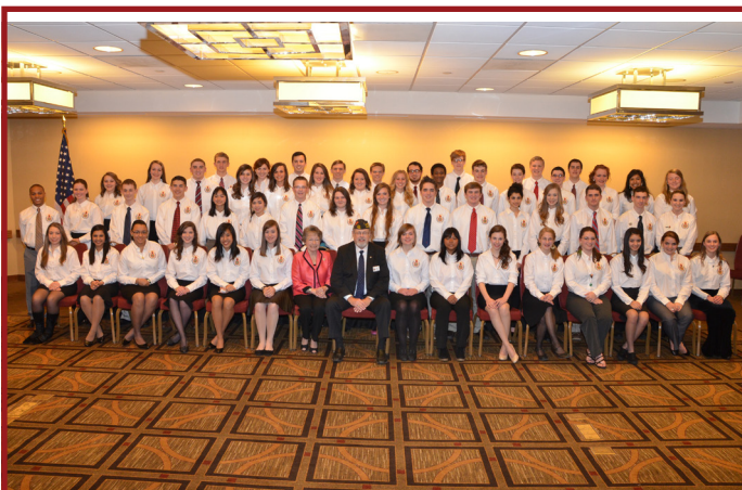
The 2013 Voice of Democracy winners during their awards ceremony in Washington, D.C.